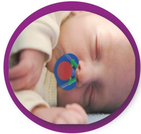
The Oxygen Soother

There are countless examples of good ideas that have been developed into powerful products, services, and improvements in the healthcare sector.